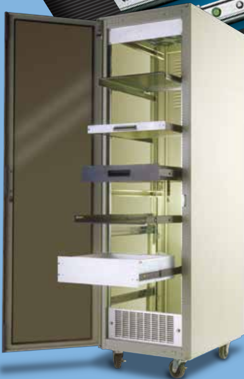
SOLID/ROLLER BEARING SLIDES